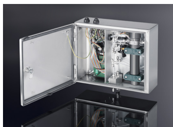
PAMAS OLS4031 in stainless steel shell

For Phosphate-Ester based hydraulic liquids (e.g. aviation hydraulic fluids), the PAMAS OLS4031 is manufactured with a special stainless steel shell that protects the housing from corrosive liquids.