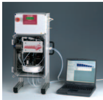
For online condition monitoring, the PAMAS WaterViewer can be fixed to the wall. Equipped with an aluminium mounting rack, it can also be used for on-site measurements.