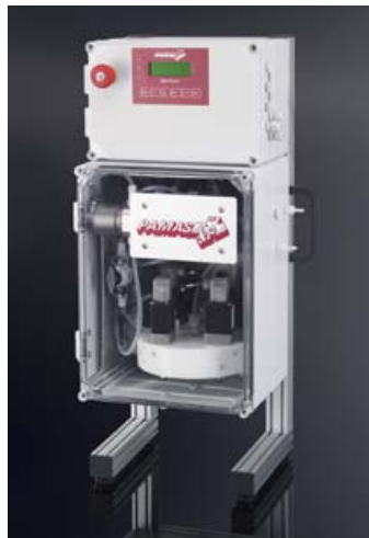
Equipped with a Multiplexer Unit, the PAMAS WaterViewer can analyse multiple waterlines.