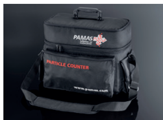
Shoulder bag PAMAS GO

The custom-fit shoulder bag provides extra space for accessories.